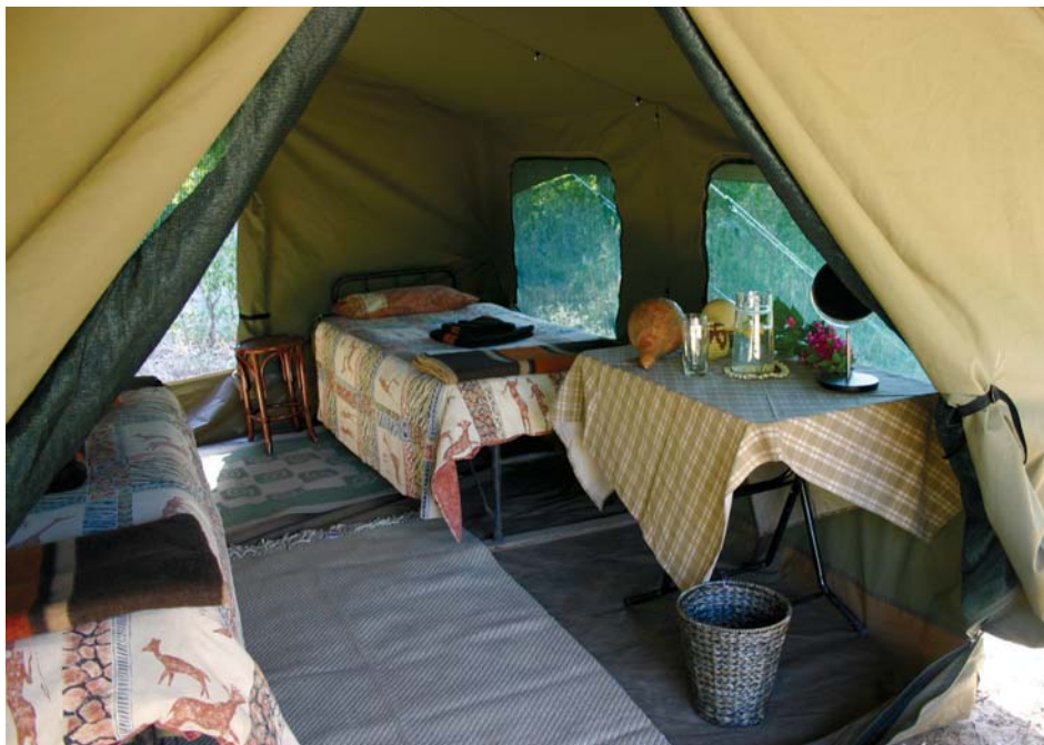
Spacious new tents, with adjacent loo tents, make the camping element of the trip distinctly luxurious