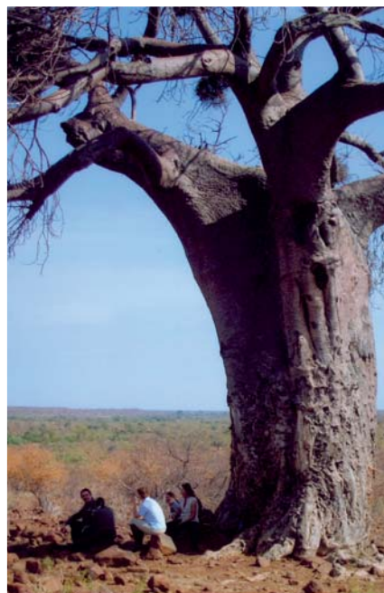
We stop for mid-ride snacks in the shade of a Baobab, one of the features of this region

We rode again after lunch, but the skies grew apocalyptic once more. We returned to the kgotla just as another storm unleashed its