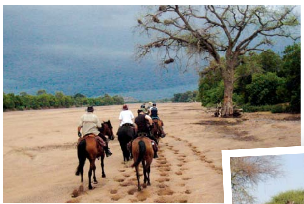
We dutifully follow Cor into the teeth of another storm while he, oblivious, discusses palm trees

▀ The storm arrived after dinner; the sort of storm film directors send back to special effects saying 'easy, guys' ▀